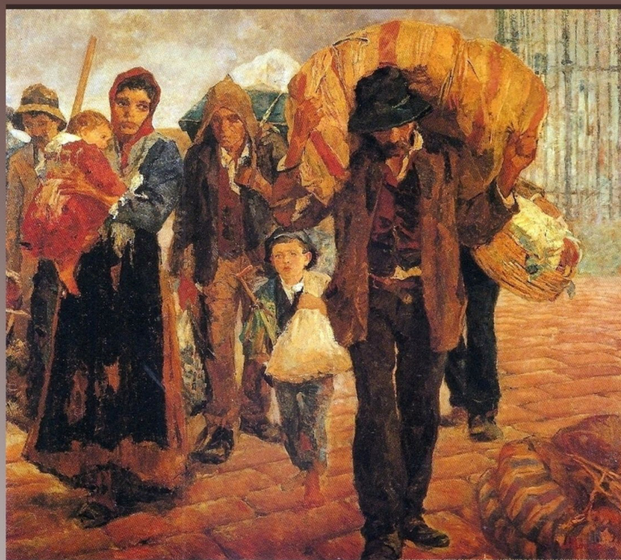
OF EMIGRANTES (THE EMIGRANTS), ANTONIO ROCCO, 1910 (WIKIMEDIA COMMONS)

IN URBAN EARLY MODERN EUROPE: LEGISLATION, DELIBERATION, PRACTICE